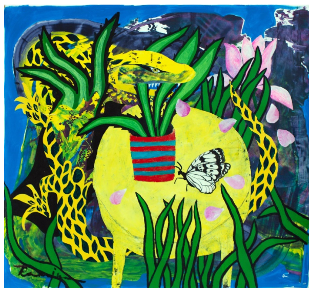
Energy of Chaos , 2022, painting