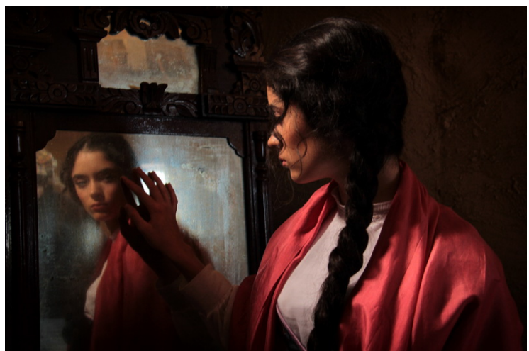
The Other Side of Me, 2022, a photo project

The Other Side of Me is where each object or moment of which is not only fixed by the camera but full of hidden meaning.