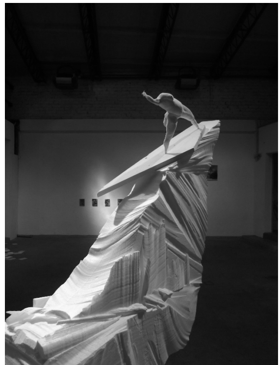
Saltation, 2022, sculpture

The sculpture tells the story of one step. To leave a stuffy room and make her own, conscious choice. What awaits the woman who takes this step, the leap into the unknown? The road ahead is full of doubts and difficulties but it is a more conscious and free one. Patriarchal, traditional society deprives women of choice in the womb. Selective abortion deprives a woman of her right to life. And if she happens to be born, from an early age her perception of the world is strictly controlled by her father, brother, family, and society. Toxic attitudes inherited from the family turn her into a dependent, non-self-acting person. Visitors are given the opportunity to feel the state before stepping into the unknown, new and free, and to experience the dynamics of the sculpture, which symbolises thousands and thousands of women's destinies.