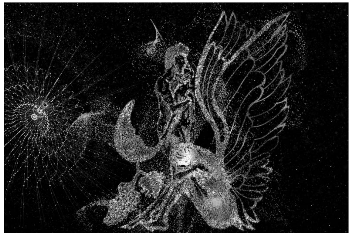
All is sacred, 2022, installation, digital media